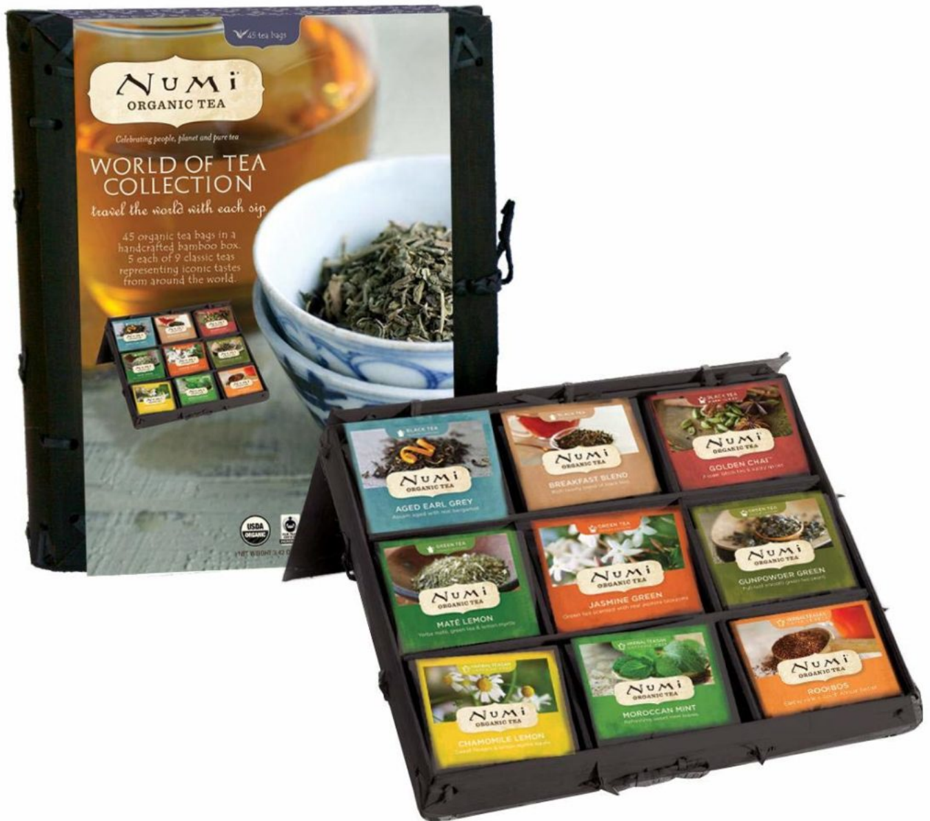
Numi Organic Tea World of Tea