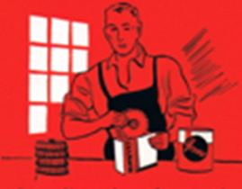
Many machine parts do not seal tightness caused inside with lacquer.