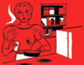
Kitchen grease, soap, butter can be wiped from the surface of lacquered packages.