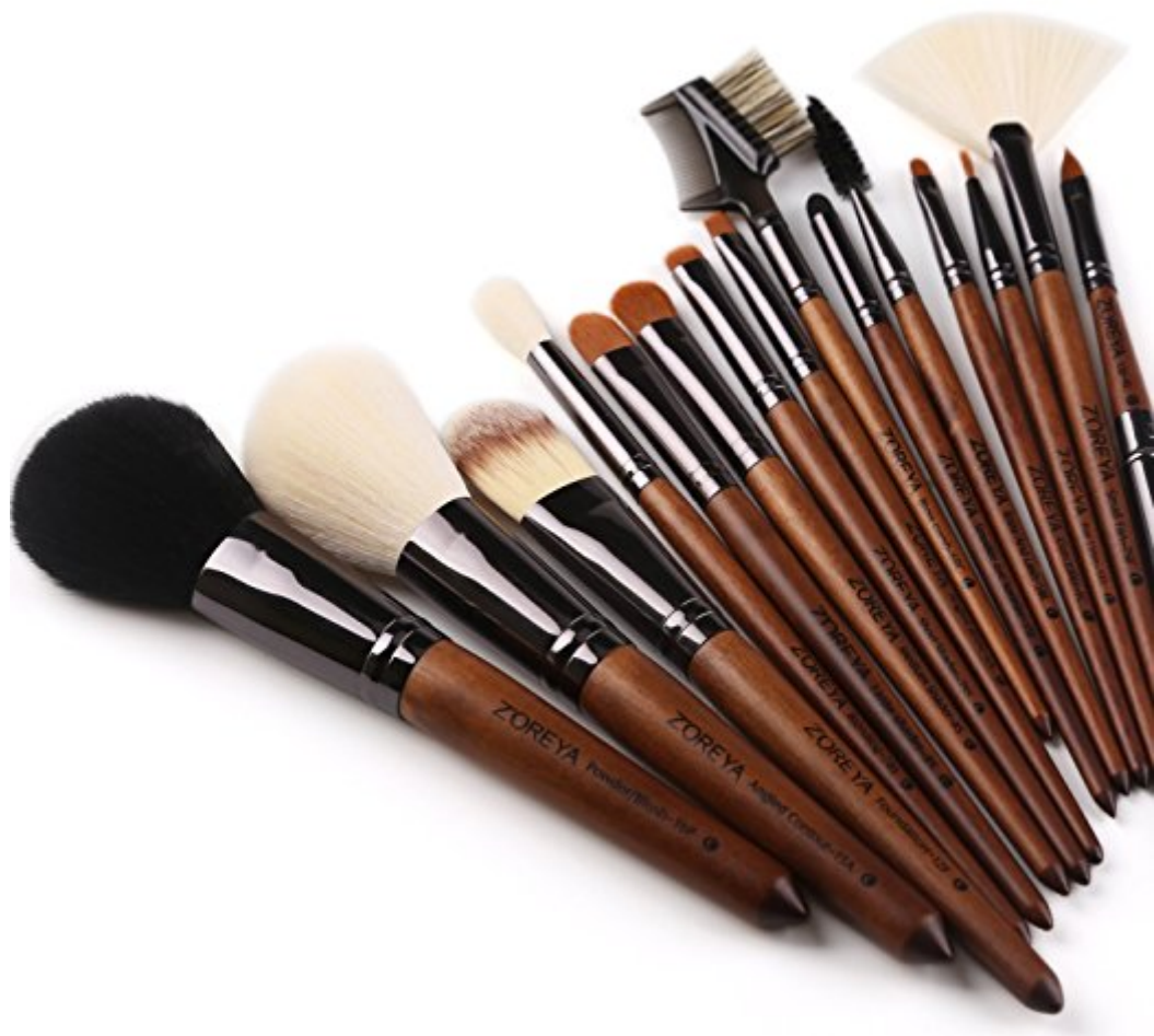
KENZIE BEAUTY 10 PCS Oval Makeup Brushes