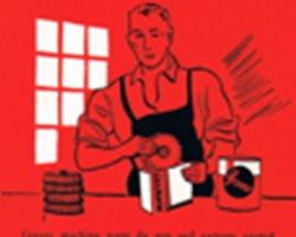
Heavy machine grease, dirt and various stains wash off with lacquer.