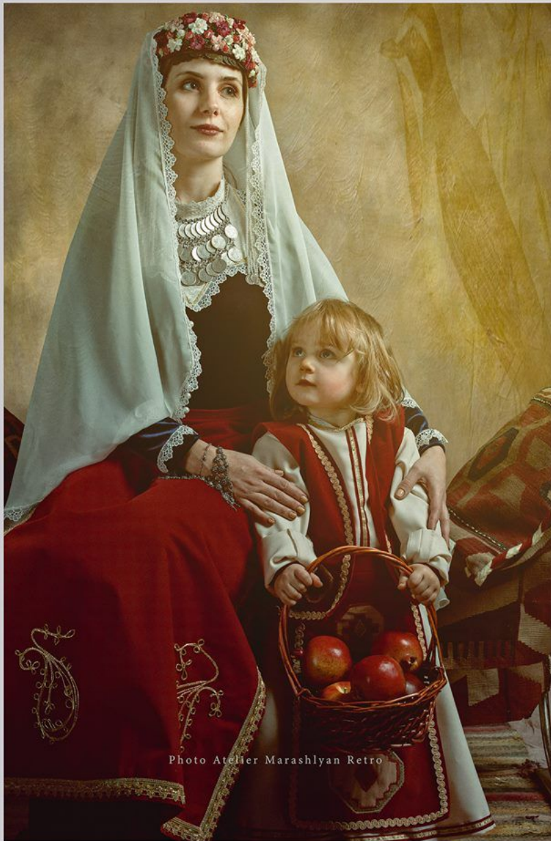
Retro